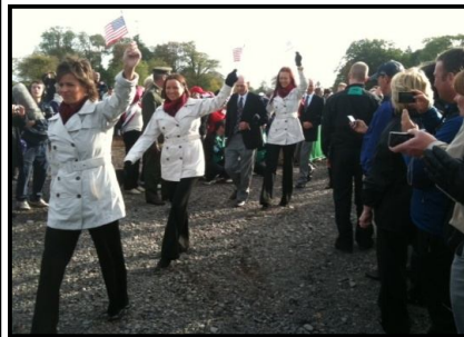
Solheim Cup Opening Ceremonies